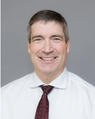
CEO, UVM Health President and COO, UVM Medical Center

University of Vermont Health is committed to improving the health and wellbeing of people in the communities we serve. Every three years, UVM Health's six health care partners conduct a Community Health Needs Assessment (CHNA). CHNAs help us to reflect on our work to date and consider the challenges and opportunities involved in creating healthier communities. This process informs how priority health needs will be addressed by each health care partner alongside our diverse community partners.