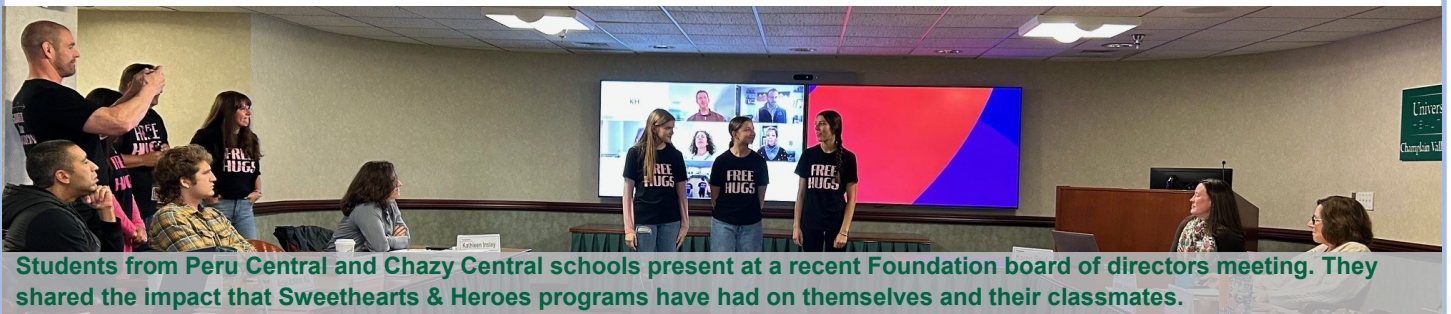
Students from Peru Central and Chazy Central schools present at a recent Foundation board of directors meeting. They shared the impact that Sweethearts & Heroes programs have had on themselves and their classmates.